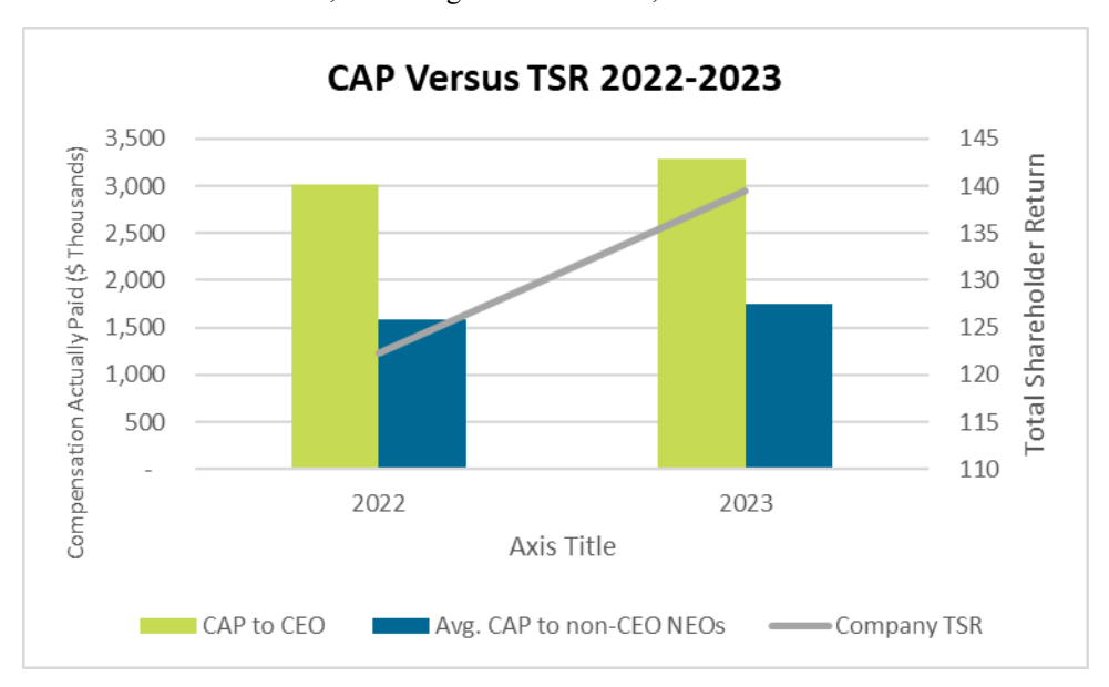
The SEC requires companies to compare CAP to CEO and all other named executive officers to cumulative TSR however, we do not link CEO or all other named executive officers' compensation to our cumulative TSR.

Cumulative TSR – The table below shows the relationship between CAP to CEO and the average of CAP to all other named executive officers, and the Bank's TSR for the period June 30, 2021 through June 30, 2023. The table assumes a $100 investment on June 30, 2021 and measures the amount by which the market value, assuming the reinvestment of dividends, has changed as of June 30, 2023: